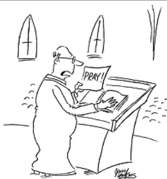
“These are the final figures for the building fund expenses.”

Belmont Christian Church will have a picnic on July 4th following Service. Hot Dogs, with fixings, drinks, ice cream and paper products will be provided. We need you to bring for example: deviled eggs, potato salad, slaw, macaroni salad, chips and fruit pies. Hope to see you there!